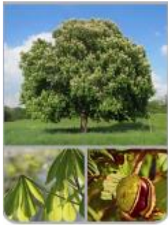
horse chestnut tree